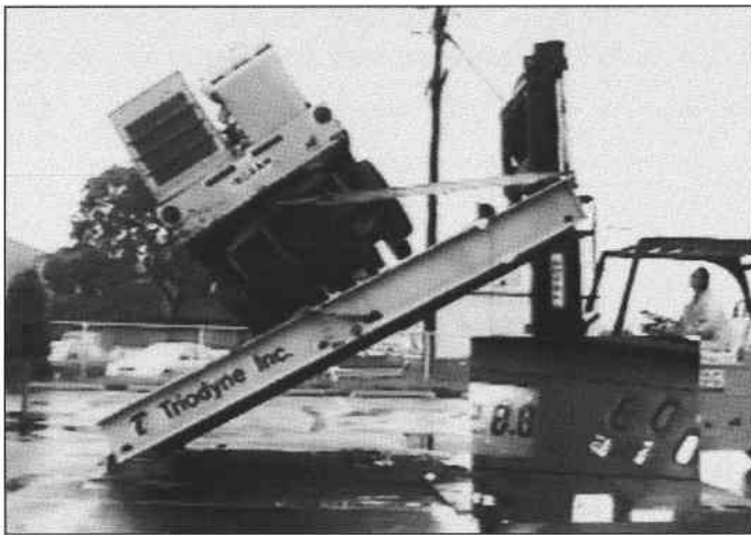
C) 6 Rear Wheels: 28.8°