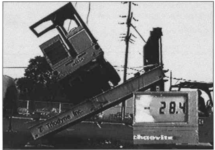
D) 6 Rear Wheels: 28.4°