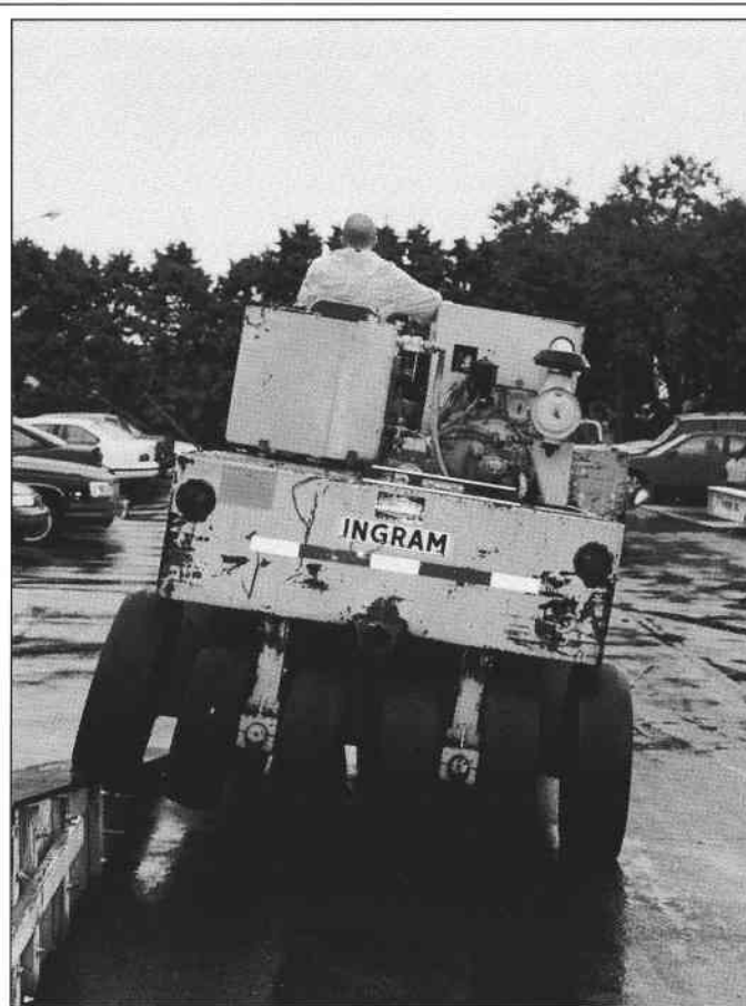
Figure 5b - Six Rear Wheels on 28.58 cm (11.25 in.) Ramp: 8.7°