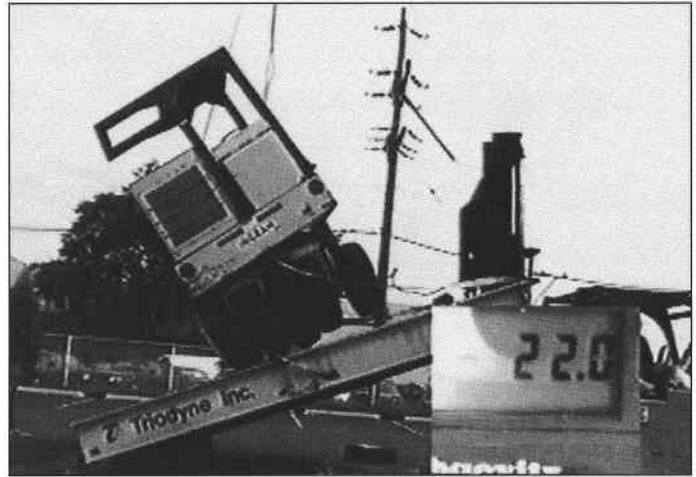
B) 4 Rear Wheels: 22.0°