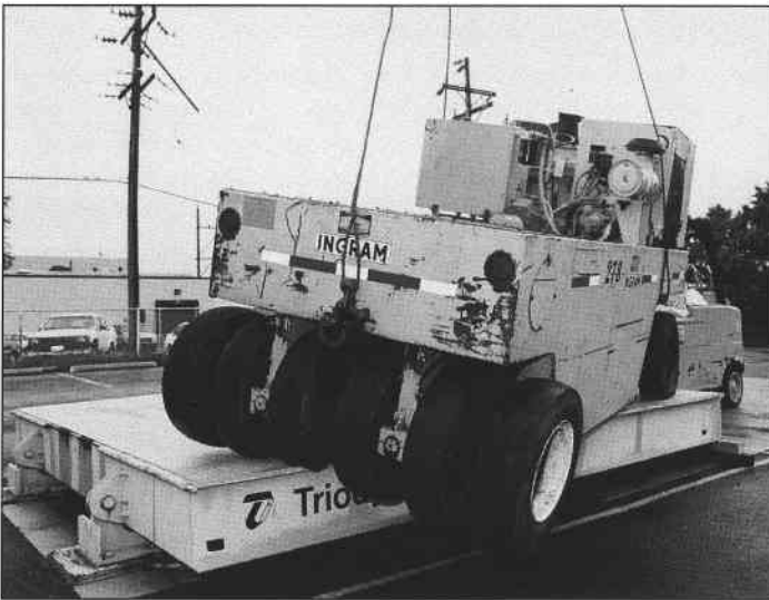
Figure 3 - Three Rear Wheels Suspended in Air