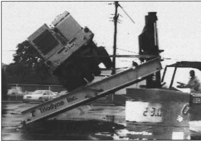
A) 4 Rear Wheels: 23.0°