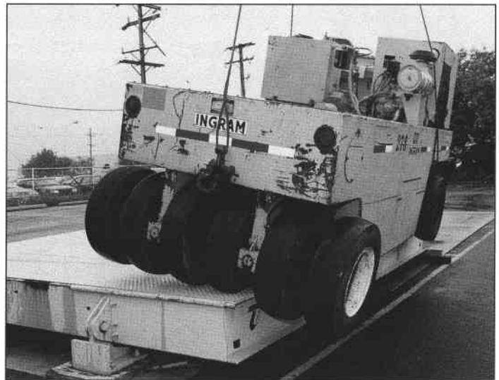
Figure 4 - One Front Wheel and Two Rear Wheels Suspended in Air

section of this paper. Furthermore, the two or four vertical uprights which form the typical ROPS structure generally compromise the operator's visibility. Operators typically compensate for these obstructions by shifting their heads and torsos to look around the obstructions.